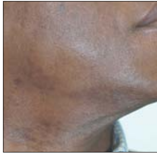
After, 12 Treatments