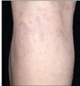
After, 1 Treatment