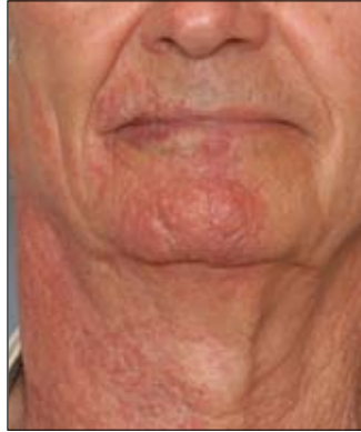
After, 24 Treatments